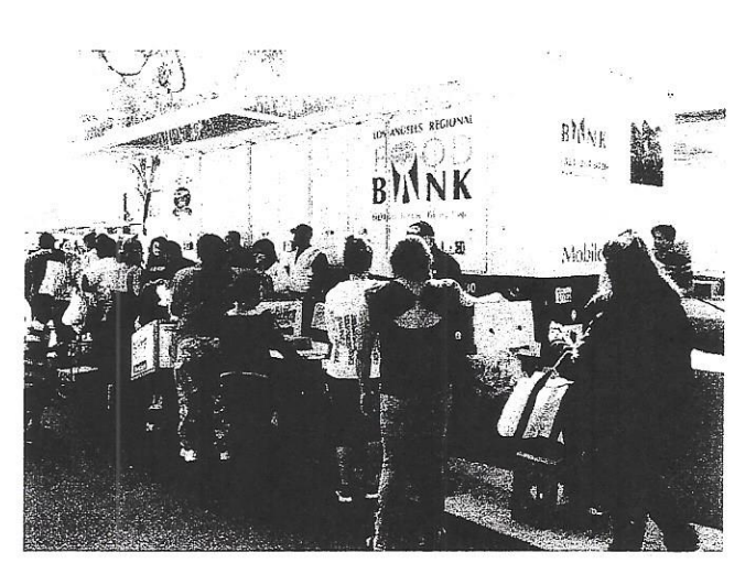
For your convenience, please bring your grocery cart or reusable bags