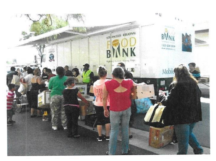
For your convenience, please bring your grocery cart or reusable bags